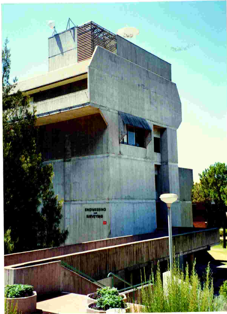
The Engineering and Surveying Building.