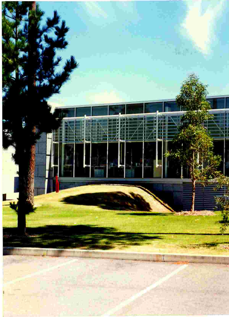
Other views of the CRA Building at Technology Park.