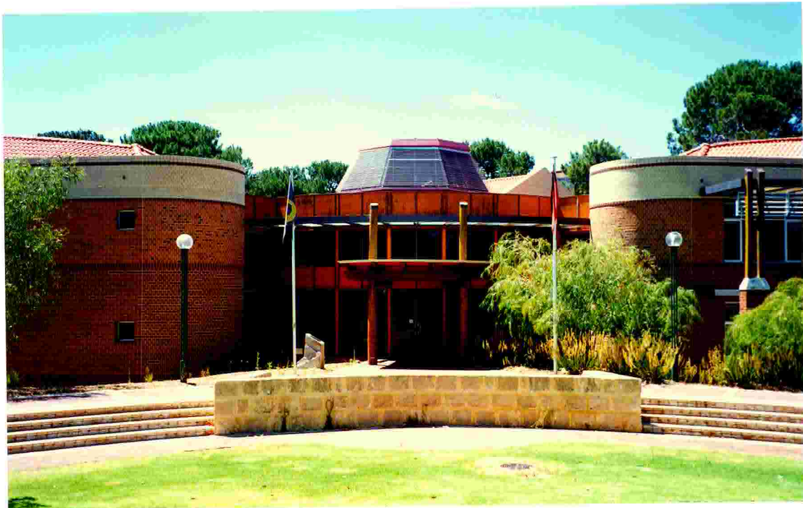
The Aboriginal Studies Building, a recent addition to the Curtin University campus, softer in architectural style than the earlier buildings.