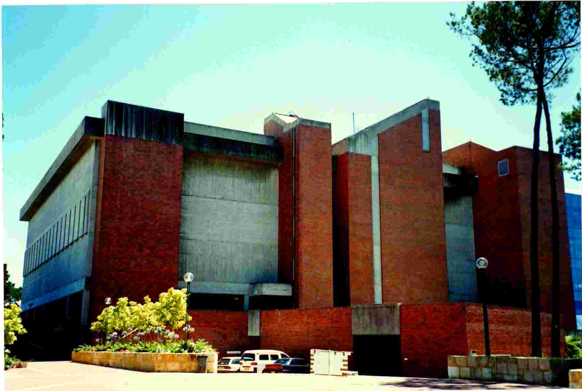
The Robertson Library Building, Curtin University.