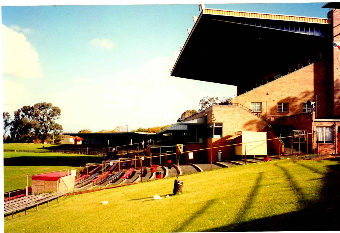
A view of the stands at Lathlain Oval.