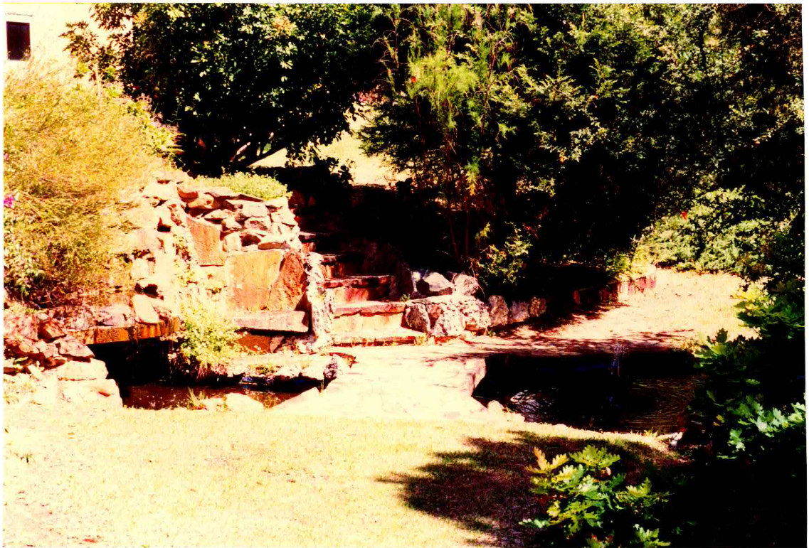
Another view of the landscaped pools in the grounds of the Red Castle Motel