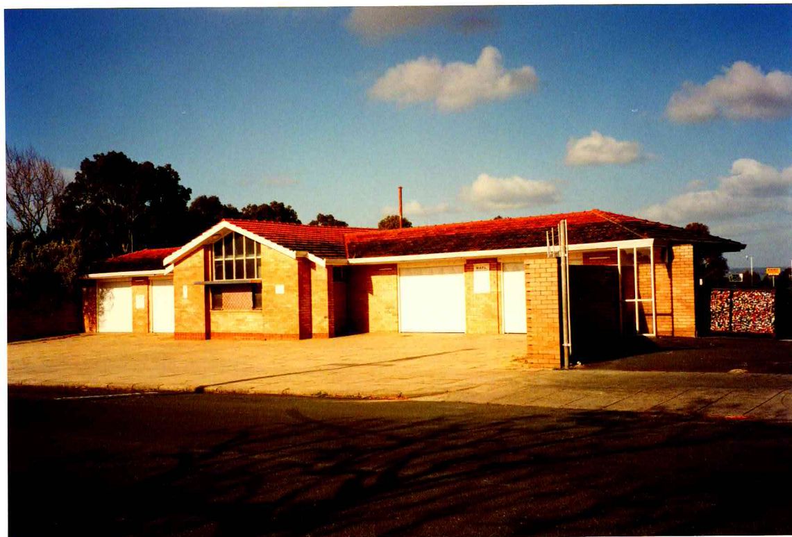
Other buildings and facilities at Lathlain Oval.